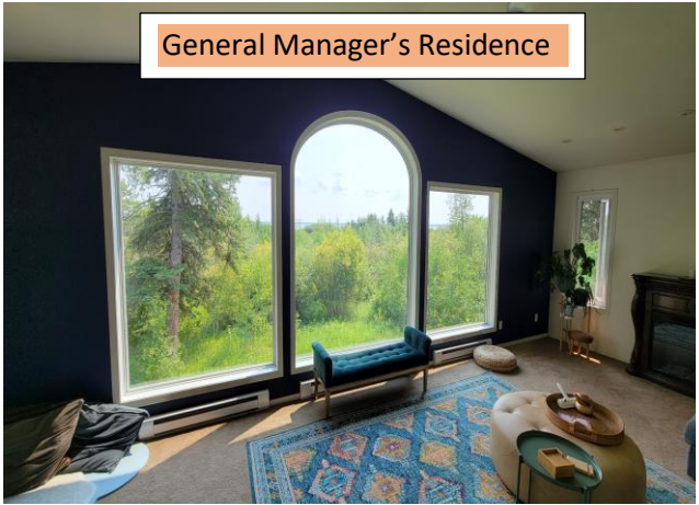
General Manager's Residence