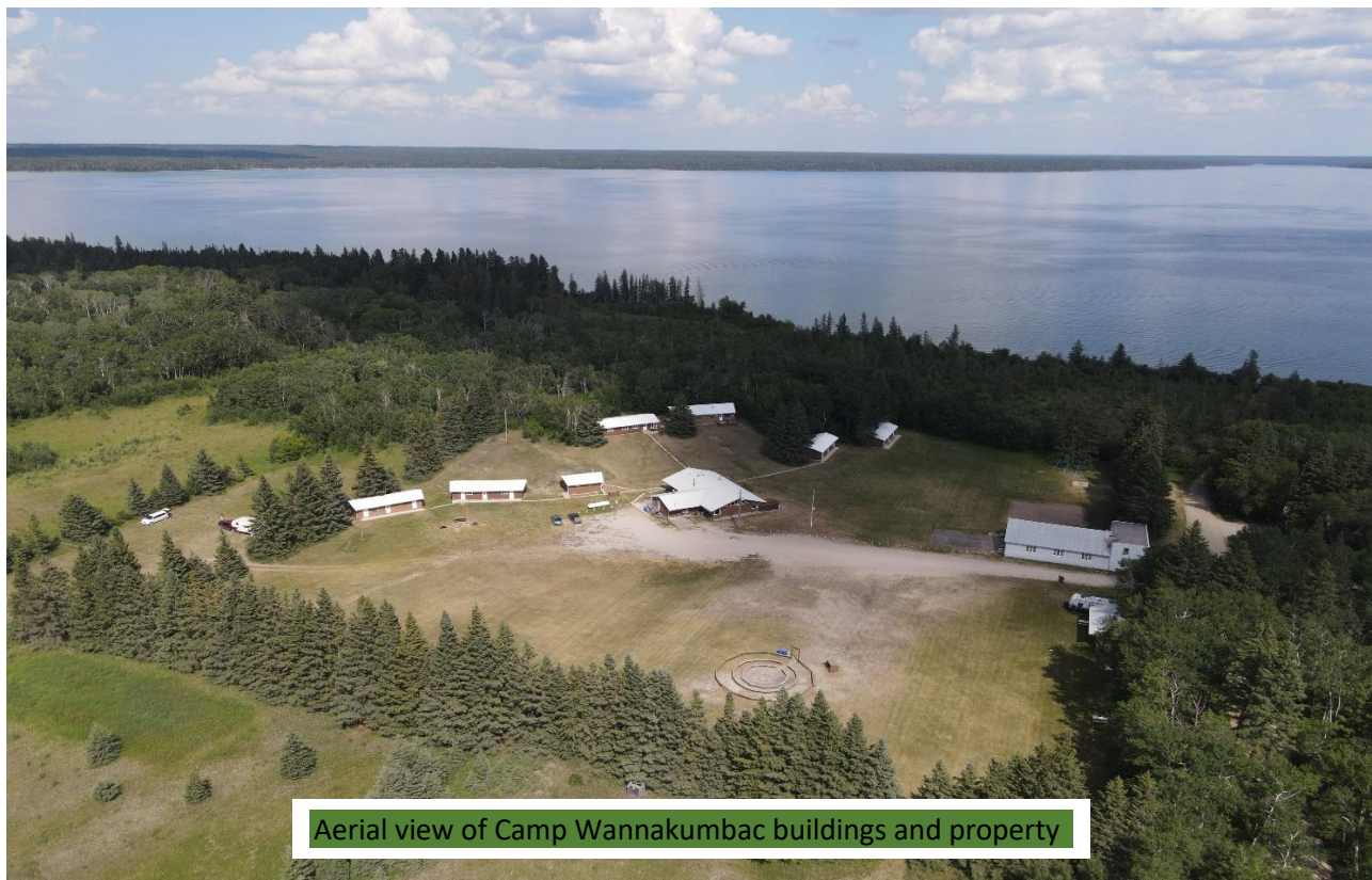
Aerial view of Camp Wannakumbac buildings and property

Interested parties are invited to send applications to wasagamingfoundation@gmail.com by Aug. 3, 2021.