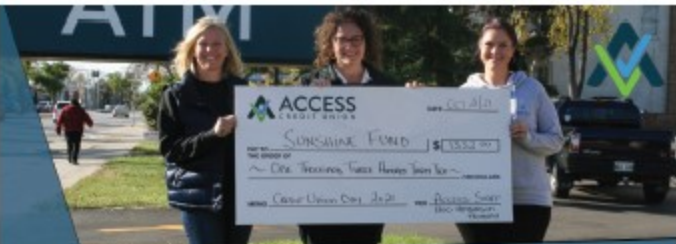
Blue Jeans Day

Henderson Hwy Access Credit Union uses Blue Jeans Day to raise funds to send kids to camp