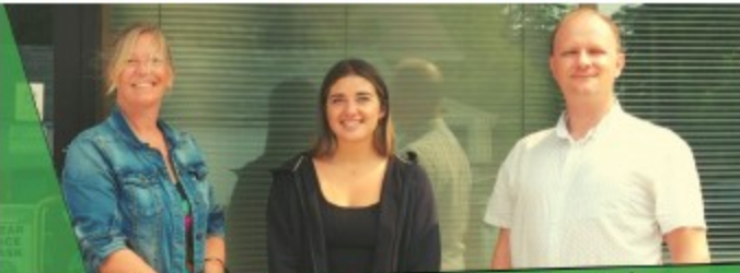
Manitoba Camping Association Green Team